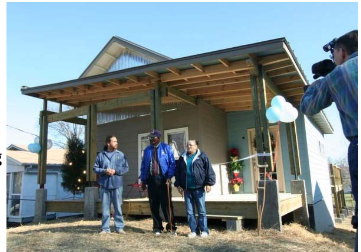
Urban Studio Home—Built by Students at UNCG

http://www.uncg.edu/iar/idec/ IDECC2006SouthRegionalConference.pdf