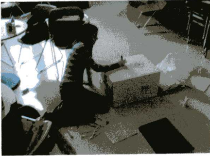
Creating boxes for Recycling Project