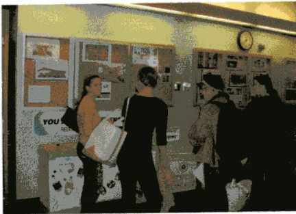
Students coming from class, recycling into designated boxes.