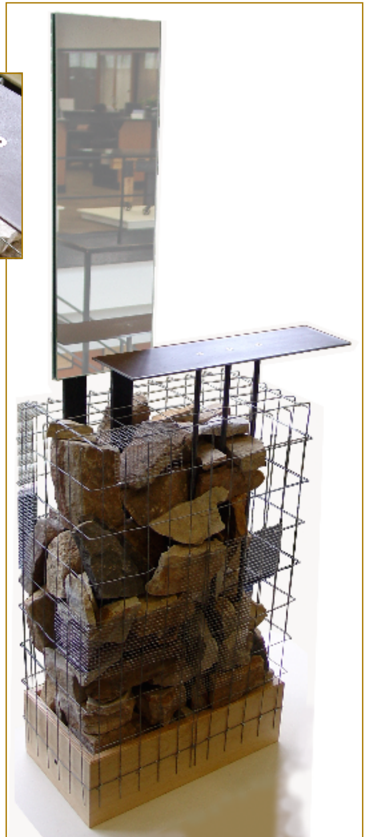
Entry Table #10 Stone, metal mesh, birch plywood, steel, mirror