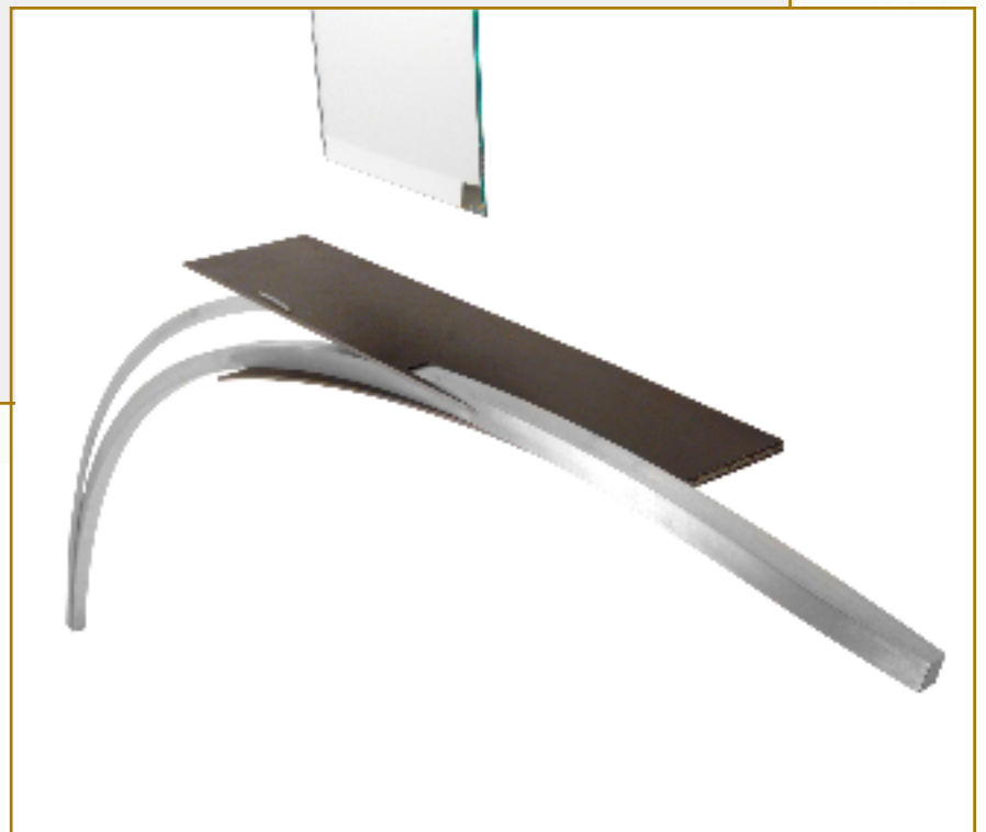
Entry Table #7 Steel, aluminum, mirror