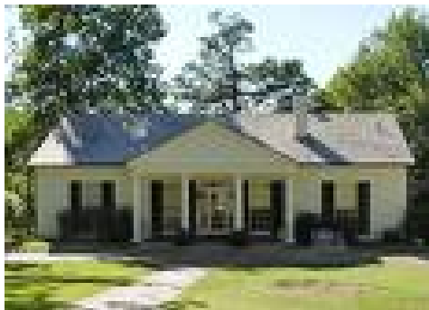
"Little White House"

Optional tours to: 'Little White House', Warm Springs, Georgia, Home of Franklin D. Roosevelt OR Callaway Gardens, Pine Mountain, Georgia